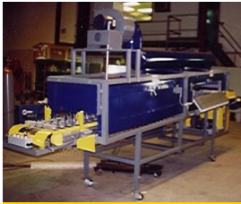
CONVEYORIZED OVEN SYSTEM WITH CERAMIC PANEL HEATERS AND CUSTOM FIXTURES