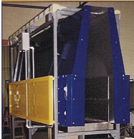
VERTICAL CERAMIC PANEL HEATER OVEN

Very little maintenance is required. Elements should be visually checked periodically to be sure that all are working. If the oven is placed in a location with extreme vibration, control panel connections should be tightened. Reflectors should be rebuffed or dusted when dirt accumulates, depending on the shop environment, if applicable.