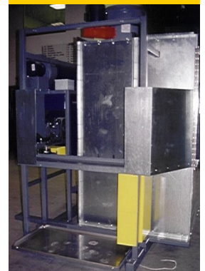
FINISHING CELL SYSTEM WITH VERTICAL OVEN CONTAINING C-O-R ELEMENTS, SPRAY BOOTH AND SPINDLE CONVEYOR