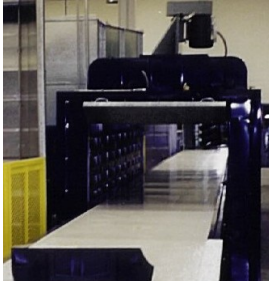
HIGH VELOCITY AIR CONVECTION OVEN WITH BUTYL BELT CONVEYOR

Absolutely not. Especially in the case of a Blasdel infrared oven, complex shapes can be evenly cured due to the reflector design and containment of convection heat in the oven. Much of the heat transfer is through conduction.