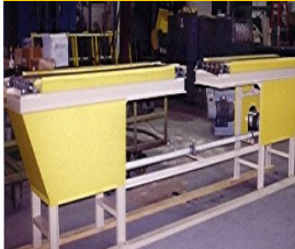
TWO SECTION CONVEYOR WITH SINGLE SHAFT DRIVE

Due to the power and thermal efficiencies of the equipment, electric IR can be very competitive. In fact, electric may appear to be three times higher per KW or BTU and still have competitive costs. For the most accurate answer, figure the costs per part estimate.