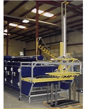
THERMOFORMING OVEN SYSTEM WITH PLC CONTROLLED PICK AND PLACE

Call 800-661-3213 and ask for a salesperson.